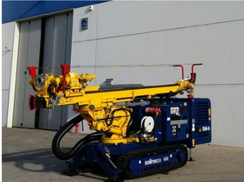
Figure 5. Photo – Modern equipment for limited access applications.

Bruce (2012) provided a summary of drilling methods indicating that double-head or dual-rotary tooling was used in the most difficult ground condition. Until recently, this equipment was not readily available within the industry and there are many examples of problems completing projects or damage done to ground conditions when holes could not be completed effectively. Double-head configurations are more readily available to some of the larger contractors and are being used more regularly.