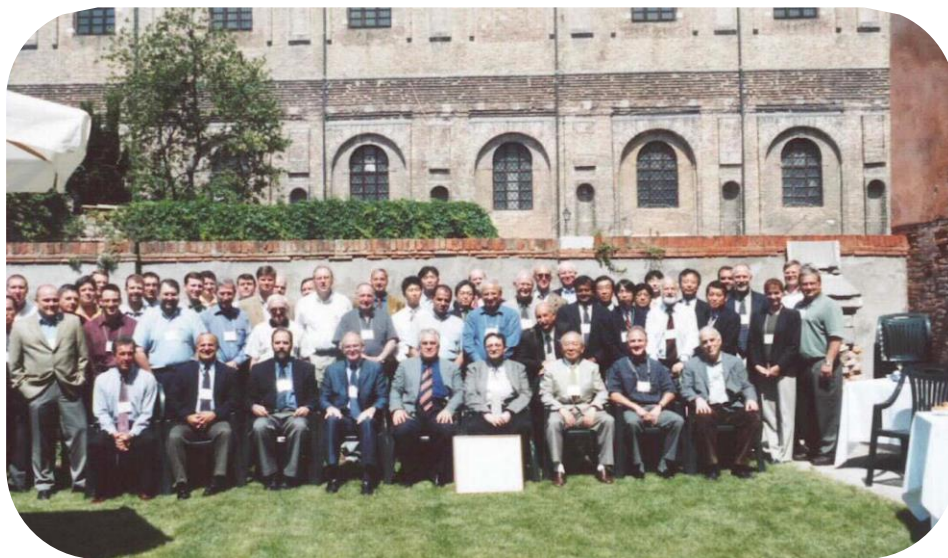
Figure 1. Photo – IWM 2002 Venice, Delegates in Palazzo Pesario Papafava.

I was first invited to the strategic meeting in Lille, France, in 2001 where a formal mission and vision for ISM was established. This led to the celebration in 2002 of the 50 th anniversary of Dr. Lizzi's contributions hosted by Renato Fiorotto in Venice.