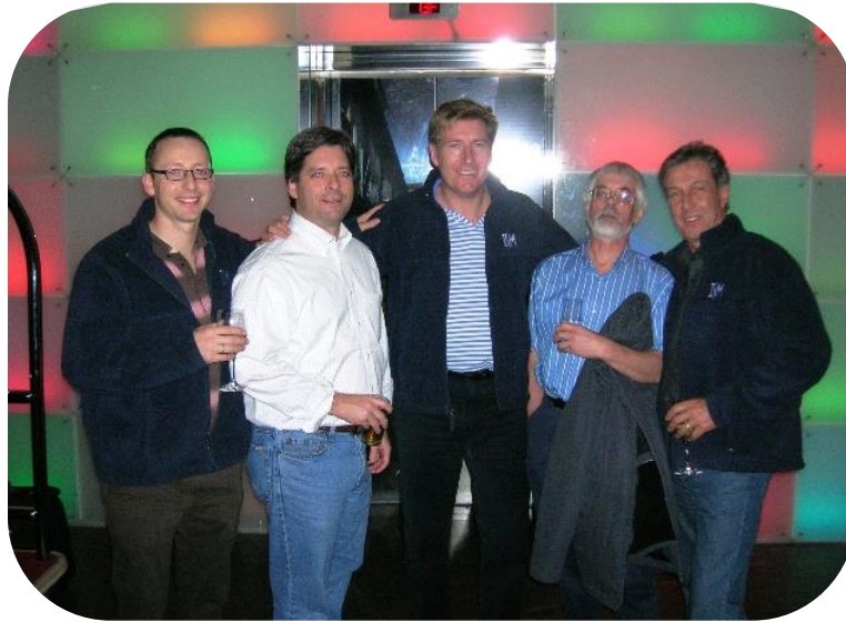
Figure 3. Photo – ISM “Educators” during UK teaching tour.