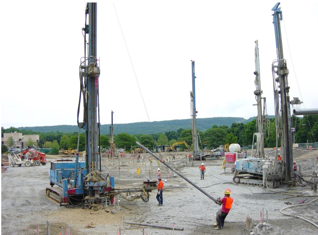
Figure 4. Photo – Large long-mast rigs make greenfield applications cost effective.

Equipment is readily available throughout our market areas. Equipment of all sizes is provided by numerous manufacturers. Equipment is often European, with some coming from Japan, and specialty equipment coming from other areas like the United States. China is also currently producing a significant number of rotary drill rigs for the foundation market in Asia. Furthermore, contractors have built their own (or modified) rigs and attachments for micropile installation. Safety criteria for rig operations are beginning to limit the opportunity for contractors to develop rigs when detailed engineering and operation manuals are being required.